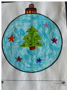
Reception – Ayaan